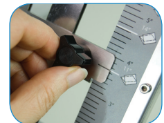
Clearly marked fold plates for quick and easy setup

The FD 314 Office Desktop Folder provides user-friendly controls in a rugged, compact unit. Clearly-marked fold settings and push-button operation make it easy to use, right out of the box. It's capable of folding 11" and 14" paper at speeds up to 7,700 sheets per hour, with a hopper capacity of up to 250 sheets.